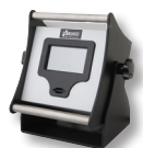
GazTrak Portable oxygen & moisture measurement