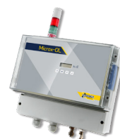
Microx-OL Online Oxygen Analyser