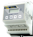
Microx Oxygen Analyser