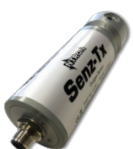
SENZTX Oxygen Transmitter